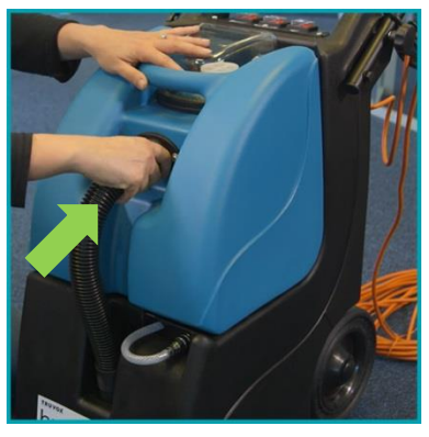
Reconnect the vacuum hose.