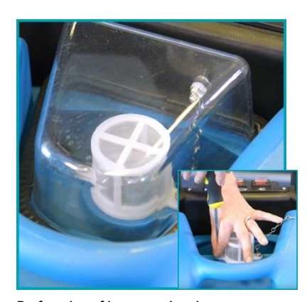
Refit the filter with the screws, replace the transparent cover and replace the recovery tank.