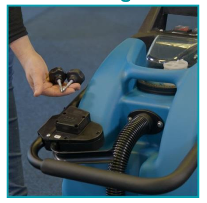
In your Hydromist Compact box you should receive the following items: