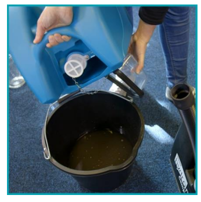
Make sure to empty the recovery tank when it is approximately \frac{3}{4} full. Do not refill the solution tank without emptying all the contents of the recovery tank first.