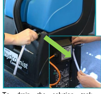
To drain the solution tank, remove the drain hose from the back of the machine, then disconnect the solution hose from the connector and fit the drain hose in its place.