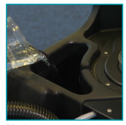
Fill the solution tank with mixed approved and cleaning chemical according to the chemical manufacturer's instructions. Warm water can be used to aid cleaning, however this can increase the risk of colours fading and carpets to shrink. If required, add defoamer solution as per manufacturer's instructions.