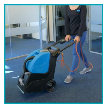
Wheel the machine forward and repeat, slightly overlapping the previous pass. Do not clean any area more than twice, or overwetting could result in carpets shrinking.