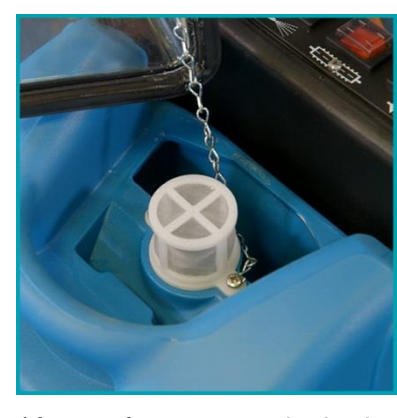
After a few passes, check the waste tank to see that no foam is present. Add extra defoamer if necessary.