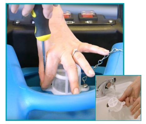
Regularly check the filter by unscrewing the filter, and rinsing out any dirt or debris.