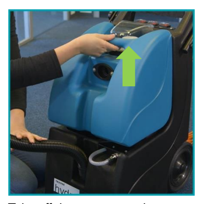
Take off the recovery tank.