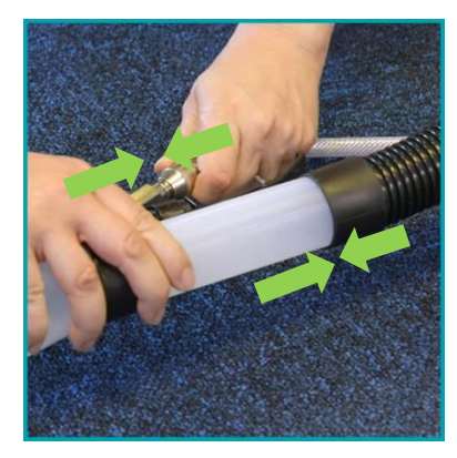
Connect the other end of the accessory to the upholstery tool.