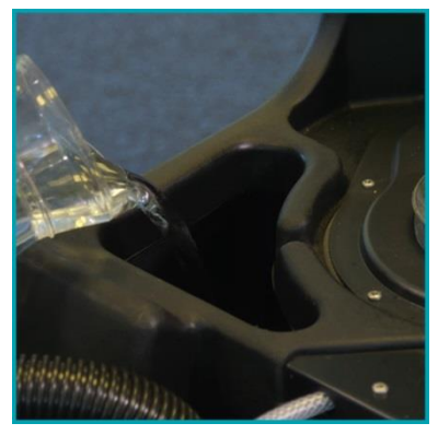
Add approx. ½ litre of clean water to solution tank and drain to flush out the tank and pump.