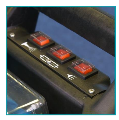
Ensure all switches are in the off position.