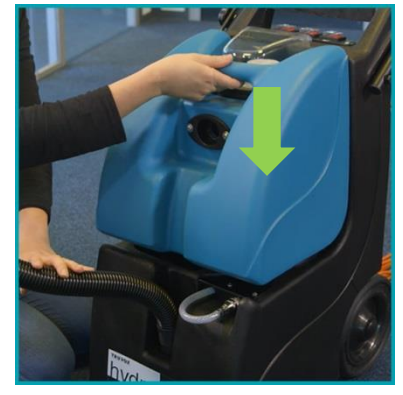
Replace the recovery tank and secure in position.