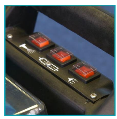
Switch OFF all switches.