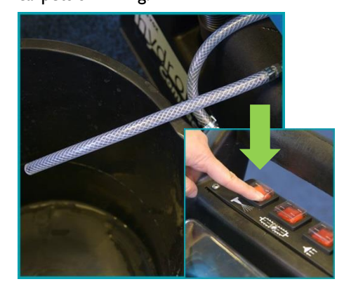
When solution spray ceases the solution tank is empty. Switch off the machine, empty the recovery tank and refill the solution tank.