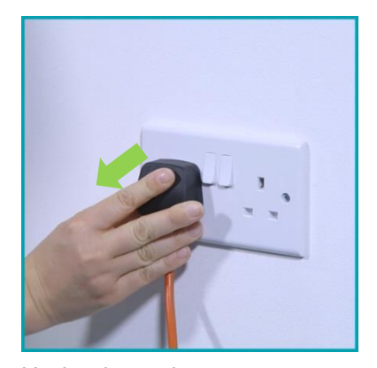
Unplug the machine.