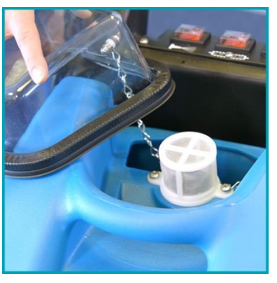
Store machine with recovery tank lid removed. Store the machine in a dry indoor area only.