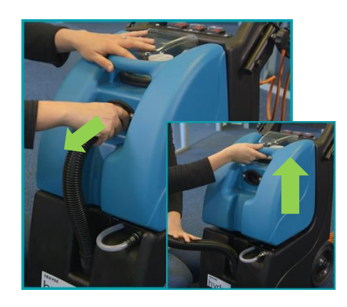
To drain the recovery tank disconnect the vacuum hose and lift off the recovery tank.