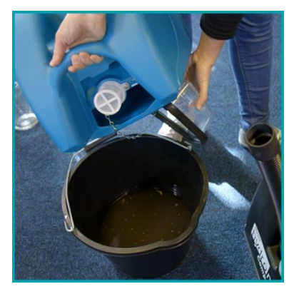
Remove the transparent cover and empty the dirty water. Rinse out the tank with clean water to remove dirt and sediment and replace the tank.