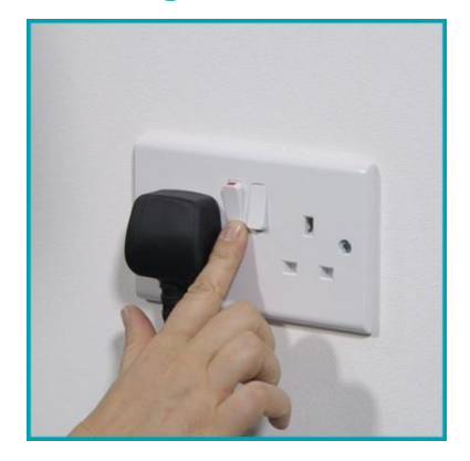
Fully unwind the supply cord and plug into a convenient socket outlet.