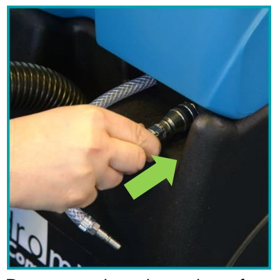
Disconnect the solution hose from the connector on the front of the machine and connect the accessory solution hose to the machine.