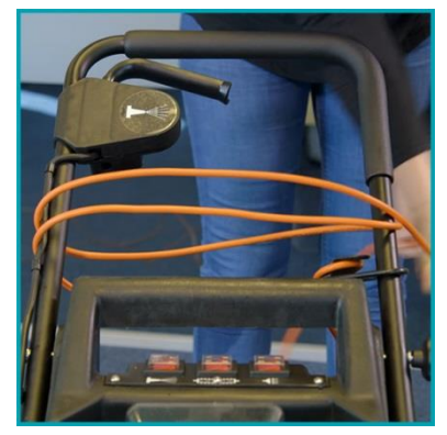
Wrap the supply cord around the handle, ensuring that the plug is not trailing on the floor.