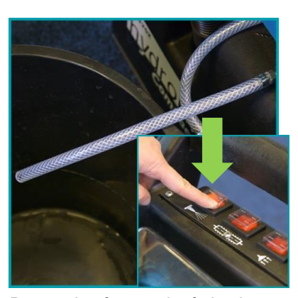
Direct the free end of the hose into a bucket and switch on the accessory spray switch. This will drain any remaining solution.