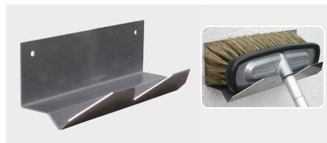
Suitable for all brushes. Hole spacing 202 mm. H x W x D = 90 x 250 x 100 mm