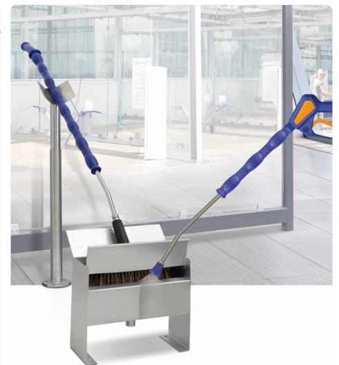
Wash brush holder, two-piece. For floor mounting and positioning for different length of lances. Holder: H x W x D: 315 x 305 x 120 mm. Support pipe: Pipe Ø 42 mm, height adjustable from 570 to 1,000 mm