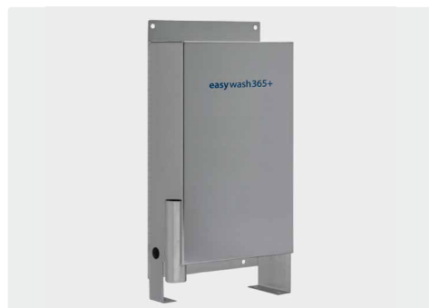
Container with overflow and lateral drain for cleaning. For wall and floor mounting. H x W x D = 670 x 340 x 143 mm