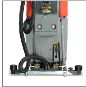
Professional self levelling Squeegee Ensuring Excellent performance