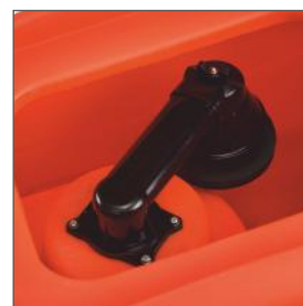
Easy tank cleaning, thanks to the large tank opening. Tank can be emptied quickly and easily via the large outlet hose. Overflow protection for the dirty water tank.