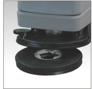
Brushes can be changed quickly without the need for any tools at the push of a button.