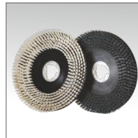
Variety of brushes to suit different applications.