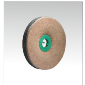
Pad holder available as option