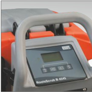
Ergonomic handle for operators of any height. Excellent view of the area to be cleaned. Soft touch buttons for selection of operation. LCD panel with display of hour meter, battery level.