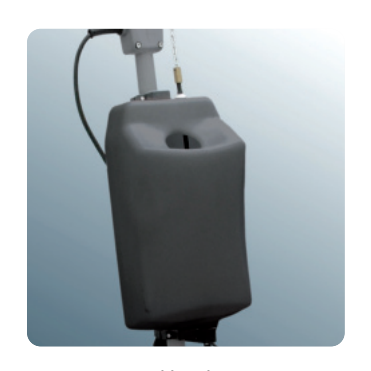
Accessories and brushes are not included. For available accessories refer to accessories pages.

0.955.0001K 11 | detergent tank (only for low speed models)